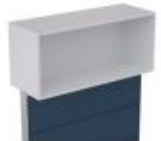
OVERPANEL OPEN OVERHEAD BACK WHITEBOARD

24" x 14" x 16" 30" x 14" x 16" 36" x 14" x 16" 48" x 14" x 16"