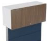
OVERPANEL OVERHEAD BACK WHITEBOARD

24" x 14" x 16" 30" x 14" x 16" 33" x 14" x 16" 36" x 14" x 16" 48" x 14" x 16"