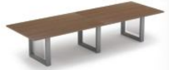
Conference table 144" x 48" x 30"