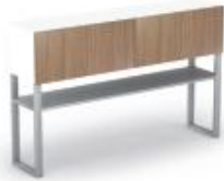
Hutch w/ flipper door