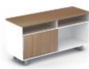
Credenza one sliding door w/pigeon holes

48" x 30" x 30" 60" x 30" x 30" 65" x 30" x 30" 71" x 30" x 30"