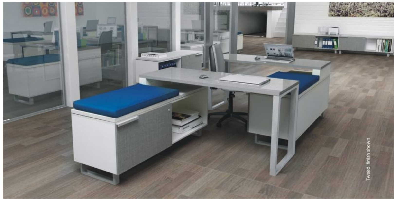
Tweed finish shown