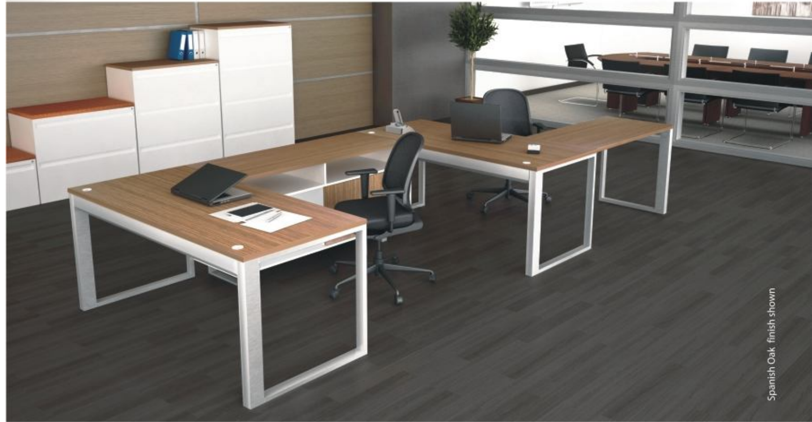
Spanish Oak finish shown

A more conventional and economical way to have the look and feel of the G Connect .