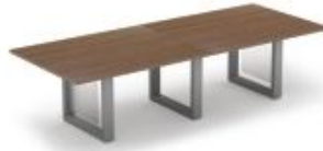
Conference table 120" x 48" x 30"