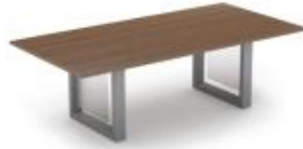
Conference table 96" x 48" x 30"